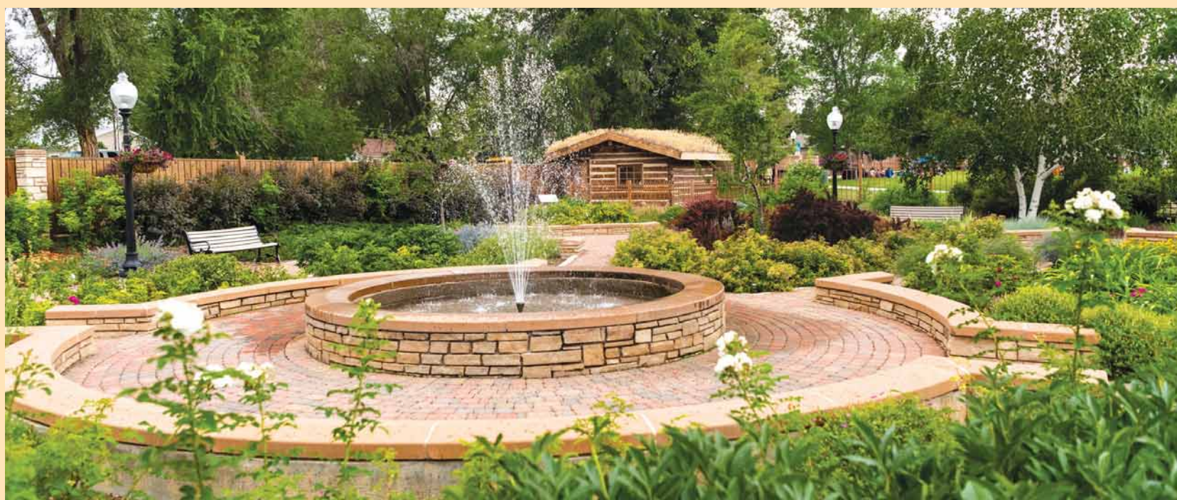
Dorothy King Reflective Flower Garden with the Mandel Cabin pictured in the background.

Whitney Commons, established in 2003, is an interactive park located in the center of Sheridan between the Sheridan County Fulmer Public Library and the The Hub on Smith at 320 West Alger, has something for everyone to enjoy. Several features include the pavilion, a playground designed for fun and safety, large turf areas supporting any number of activities, the popular water spray grounds, an amphitheater and plaza area, vintage lighting illuminating pedestrian walks and bike paths, the Dorothy King reflective flower garden and closed circuit cameras providing park security and online viewing.