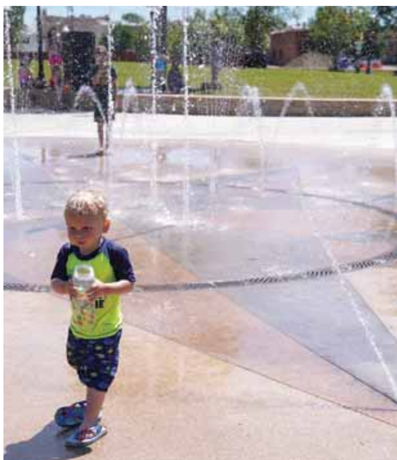
Whitney Commons Spraygrounds

Investment Steward Certification Validated Oct. 22, 2021