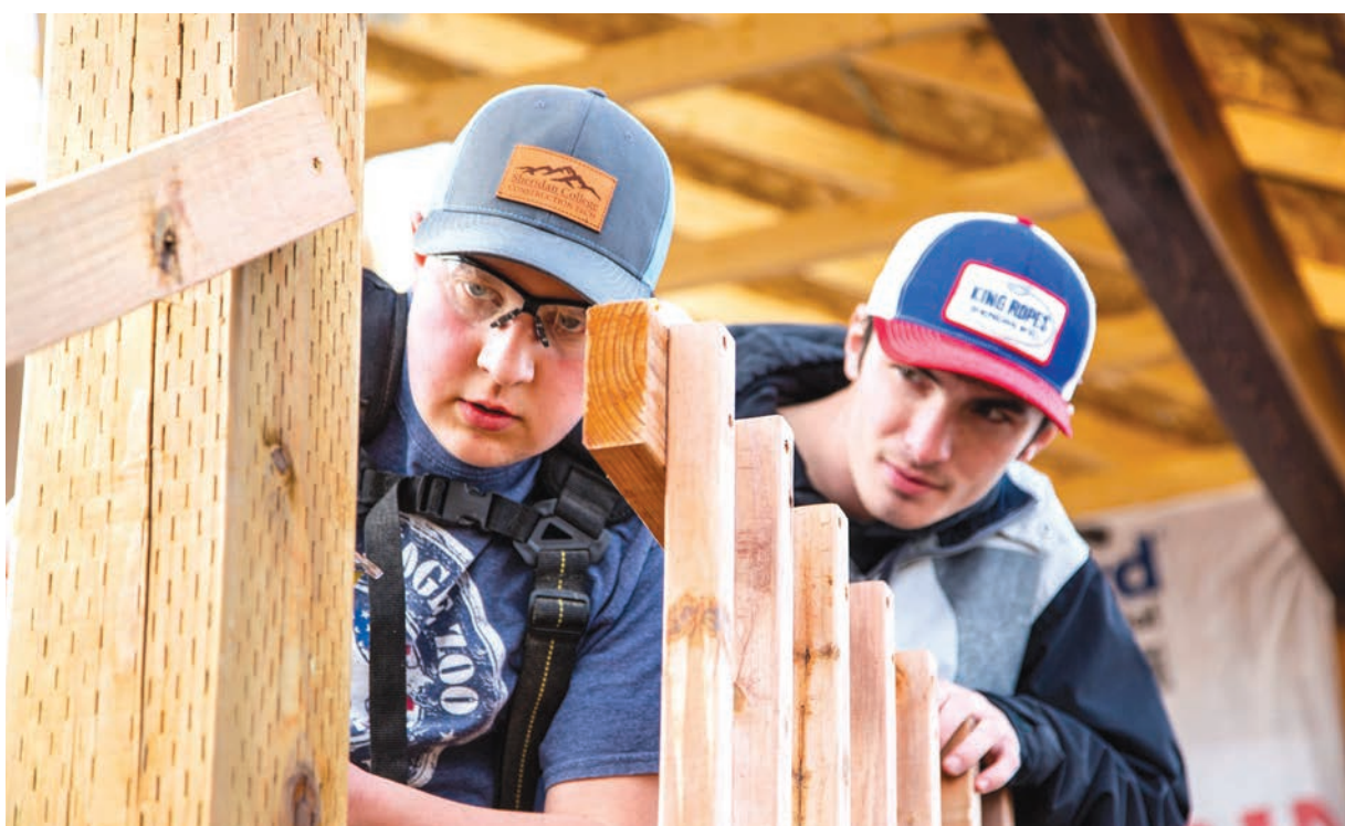
Construction technology students work through a project at Sheridan College.

In 2014, Whitney Benefits committed to the largest gift in the history of Sheridan College in the amount of $25.3 million. In 2022, Whitney continued to fund this extraordinary gift with a grant of $2,131,210. The commitment from Whitney Benefits to Sheridan College included the necessary $1.3 million required to complete the $8 million Mars Agriculture and Science