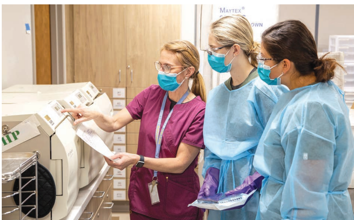
Dental hygiene students work in the lab at Sheridan College.

Center renovation project, $16 million to support the renovation and construction of the Whitney Center for the Arts Building, $2 million to support infrastructure and parking improvements on the main campus and $6 million for approximately half of the Tech Center renovation and expansion project.